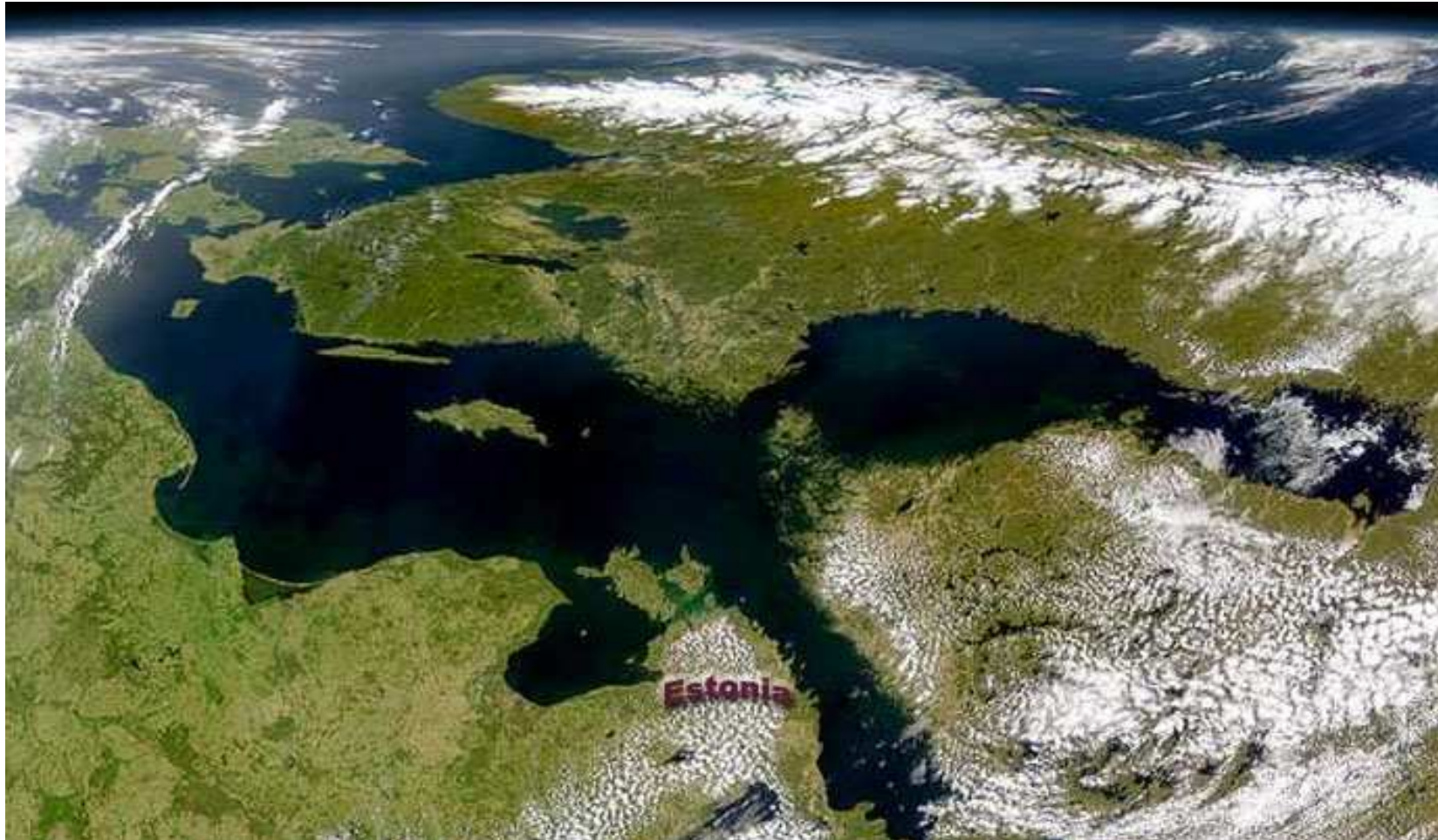
Estonia from the Satellite