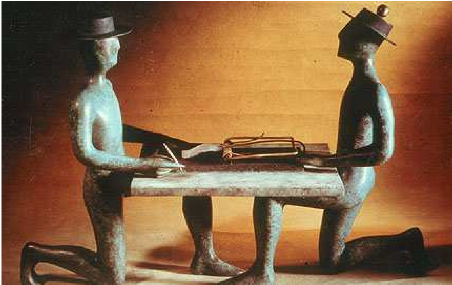
Kalev Mark Kostabi, "The Art of the Deal"