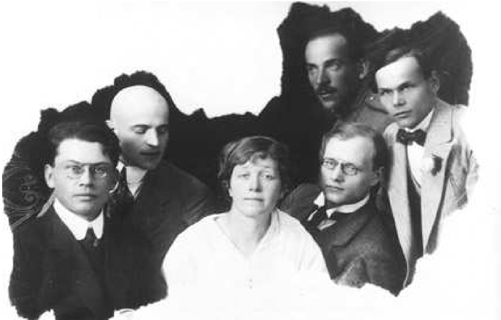
“Siuru” (1917): F. Tuglas, A. Adson, M. Under, A. Gailit, J. Semper, H. Visnapuu

Poetry in Independent Estonia M. Under, H. Visnapuu, B. Alver, et al.