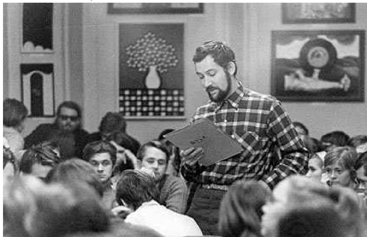
Jaan Kaplinski performing a poem in 1960s

Prose and Drama: M. Unt, M. Kõiv, V. Luik, T. Õnnepalu, A. Kivirähk, et al.