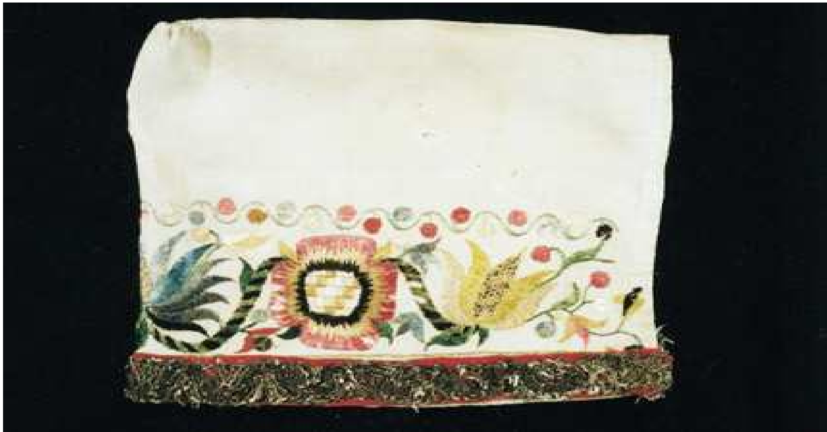
Coif (ladies' head dress)

K. J. Peterson, F. R. Kreutzwald and the epic "Kalevipoeg"